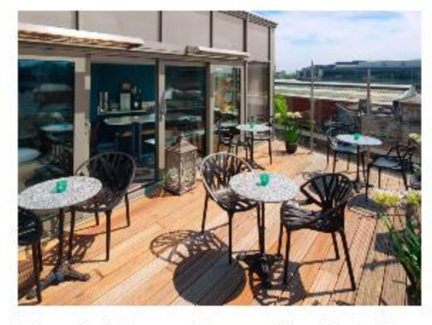
The Address Connolly Hotel