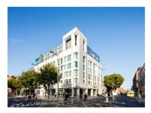
Central Hotel: Holiday Inn Express Dublin City Centre