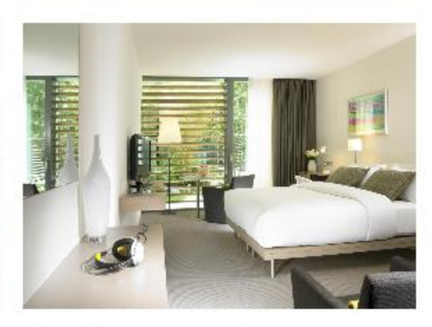
The Gibson Hotel