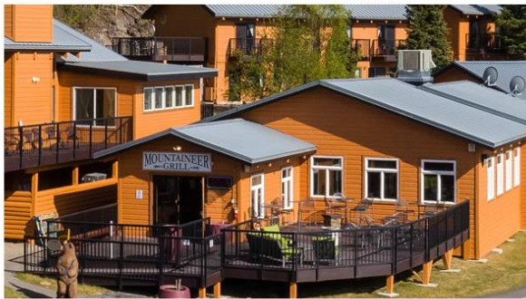
Denali Bluffs Hotel