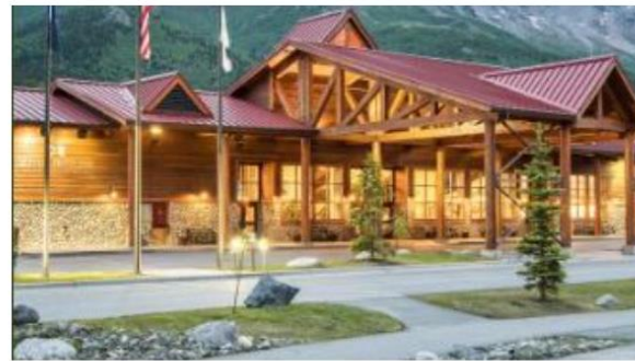
Denali Princess Wilderness Lodge