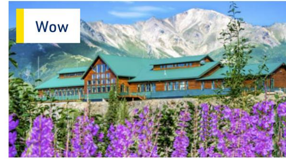
Grande Denali Lodge