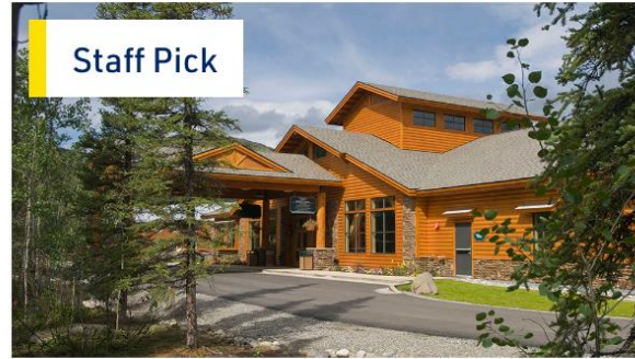
Denali Park Village